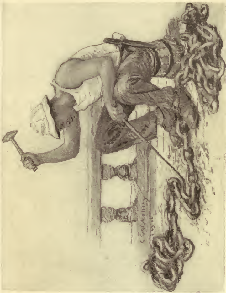
St. Thomas, Virgin Islands, D. C. 11111